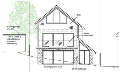
Front Elevation (North West)

An outstanding home with the added advantage of making all your own choices internally at an exceptionally high specification.