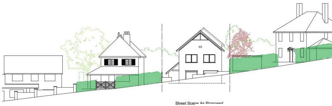
Street Scene As Proposed

An outstanding home with the added advantage of making all your own choices internally at an exceptionally high specification.